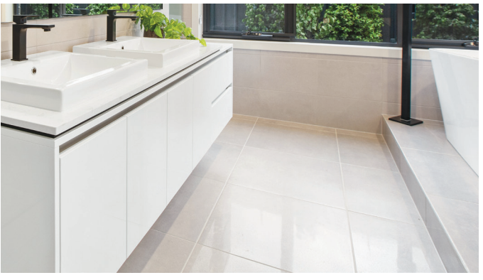
LARGER WET AREA TILES