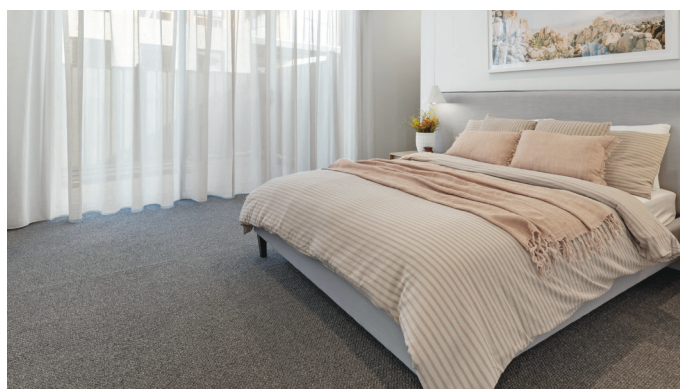
LOOP PILE CARPETS