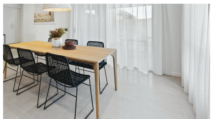
450MM X 450MM MAIN FLOOR TILES