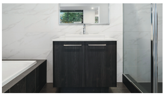
DESIGNER SINGLE VANITY