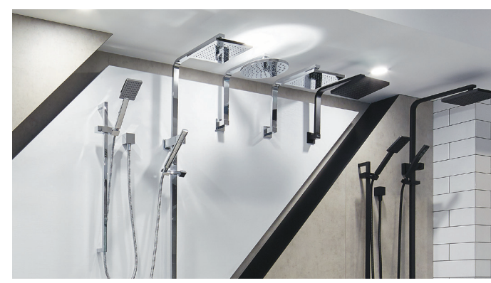
EUROPEAN STYLE SHOWER HEADS