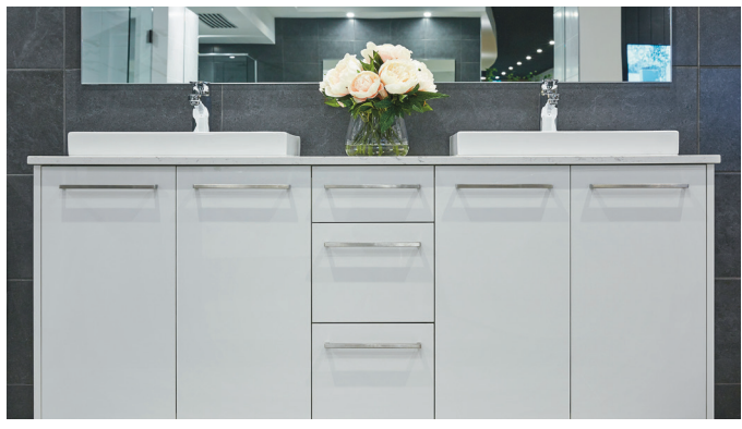
DESIGNER DOUBLE VANITY