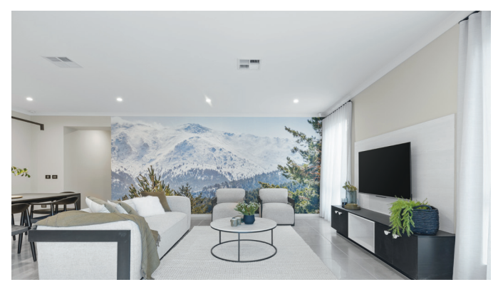
31C HIGH CEILINGS