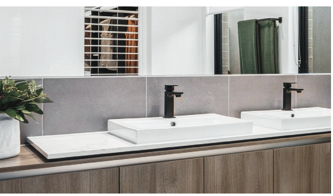
EUROPEAN STYLE BASINS