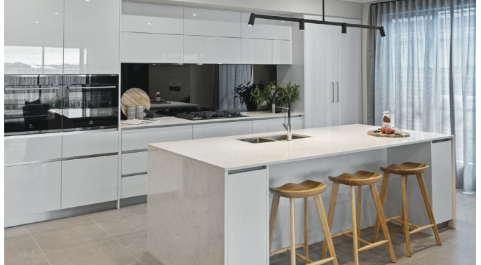
STONE BENCH TOPS, BREAKFAST BAR, OVERHEAD CUPBOARDS AND MUCH MORE

Our Luxury Specification has features that makes your home complete from the moment you walk in. Fully Ducted Reverse Cycle Air Conditioning, LED downlights, High ceilings, Luxury Scullery and Laundry, large floortiles, European style tapware, showerheads and basins, carpets, amazing Luxury Kitchen and more. Our Luxury Kitchens feature an entertainer's stone island bench with waterfall ends, double wall ovens, five burner glass gas cooktop, integrated rangehood and endless storage making cooking in your kitchen an absolute dream! Make your kitchen your own with your choice of cabinetry colours, splashbacks, and stone benchtops.