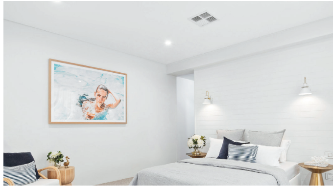
FORD & DOONAN FULLY DUCTED REVERSE CYCLE AIR CONDITIONING