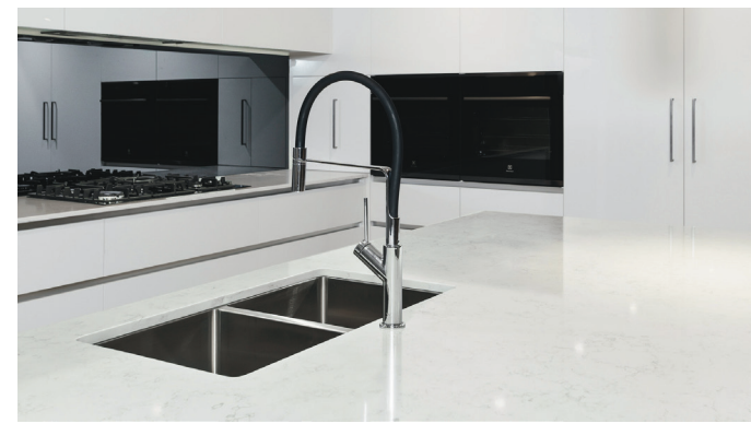
EUROPEAN STYLE FLICKMIXER TAPWARE THROUGHOUT