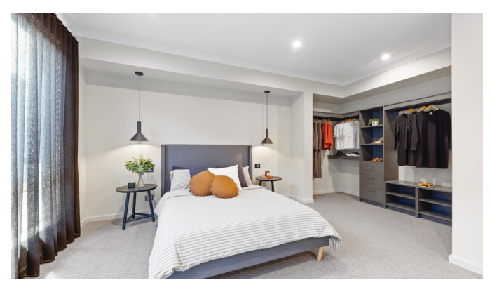
REVERSE CYCLE AIR CONDITIONING