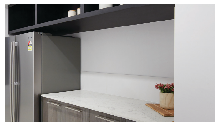
DESIGNER SCULLERY *IF SHOWN ON PLAN