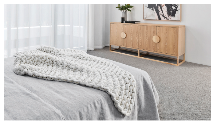
CARPETS ON UNDERLAY