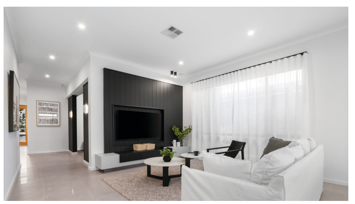
LED DOWNLIGHT PACKAGE