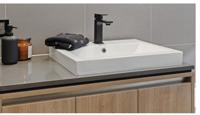
EUROPEAN STYLE VANITY