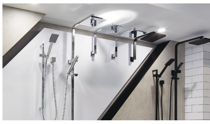
EUROPEAN STYLE SHOWER HEADS