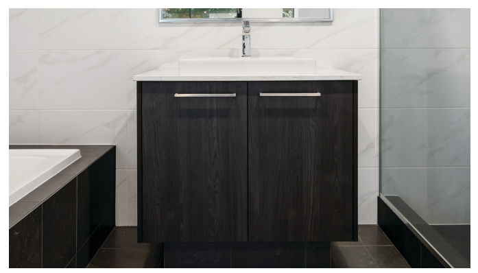
DESIGNER SINGLE VANITY