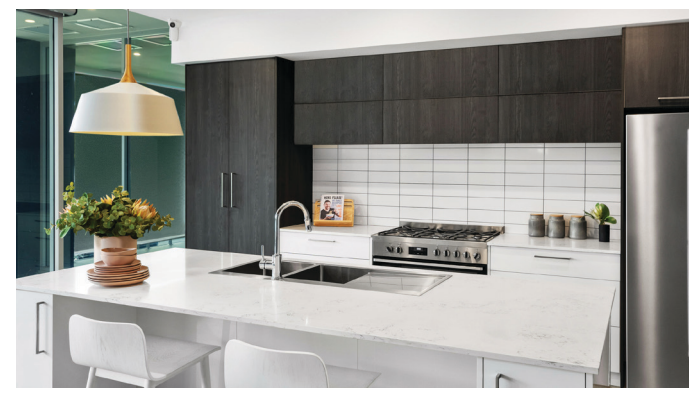
STONE BENCH TOPS, BREAKFAST BAR, OVERHEAD CUPBOARDS AND MUCH MORE

Our Designer Specification has features that makes your home complete from the moment you walk in. Fully Ducted Reverse Cycle Air Conditioning, LED downlights, high ceilings, Scullery, Designer Laundry, large floor tiles, European style tapware, showerheads and basins, carpets, amazing Designer Kitchen and more. Our Designer Kitchens feature an entertainer's stone island bench with breakfast bar, 900mm wide stainless steel freestanding stove, integrated rangehood and endless storage making cooking in your kitchen an absolute dream! Make your kitchen your own with your choice of cabinetry colours, splashbacks, and stone benchtops.