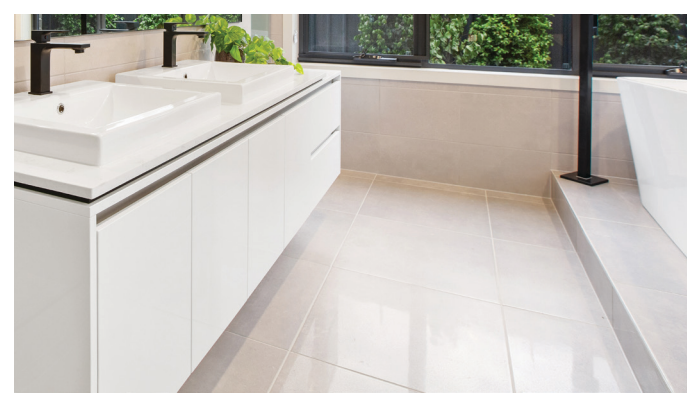
LARGER WET AREA TILES