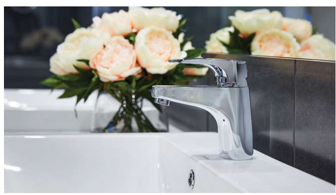
EUROPEAN STYLE FLICKMIXER TAPWARE THROUGHOUT