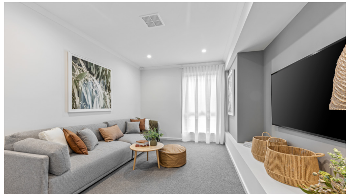
DUCTED HEATING, INTERNAL 3 COAT WALL PAINTING, DOUBLE LOCK UP GARAGE