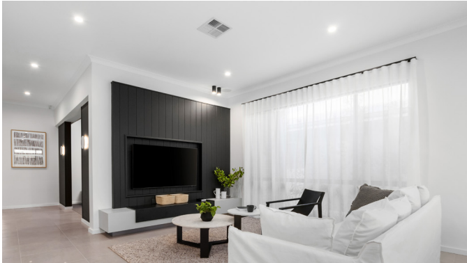
LED DOWNLIGHTS THROUGHOUT