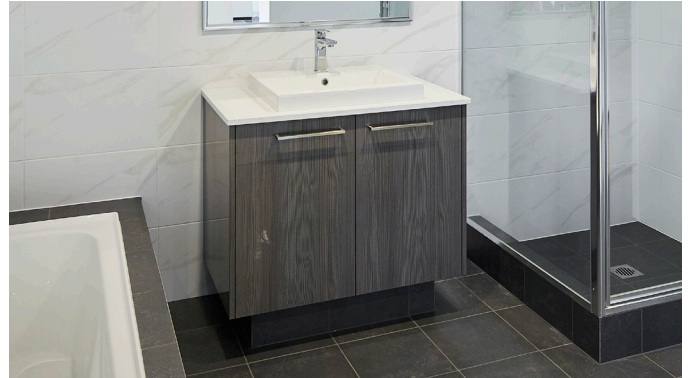
BATHROOM & ENSUITE - SINGLE DESIGNER VANITY WITH STONE BENCHTOP AND HIGH GLOSS CABINETS