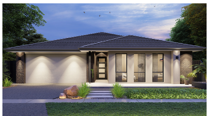
CATEGORY 1 ELEVATION