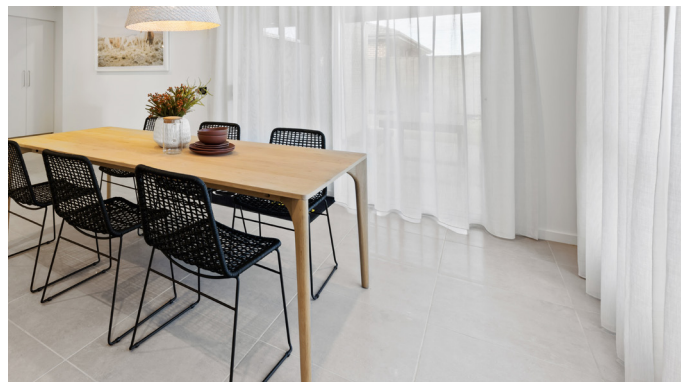
450MM X 450MM MAIN FLOOR TILES