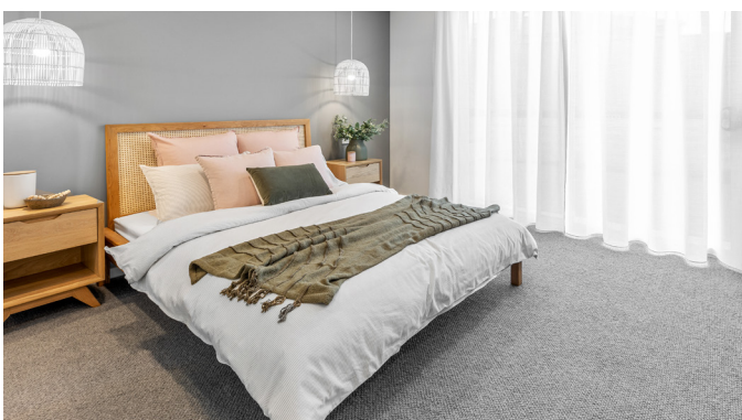
LOOP PILE CARPETS