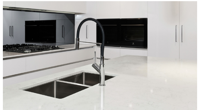
EUROPEAN STYLE FLICKMIXER TAPWARE THROUGHOUT