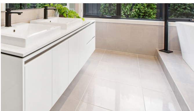
LARGER WET AREA TILES