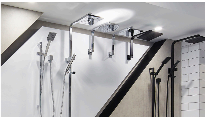
EUROPEAN STYLE SHOWER HEADS