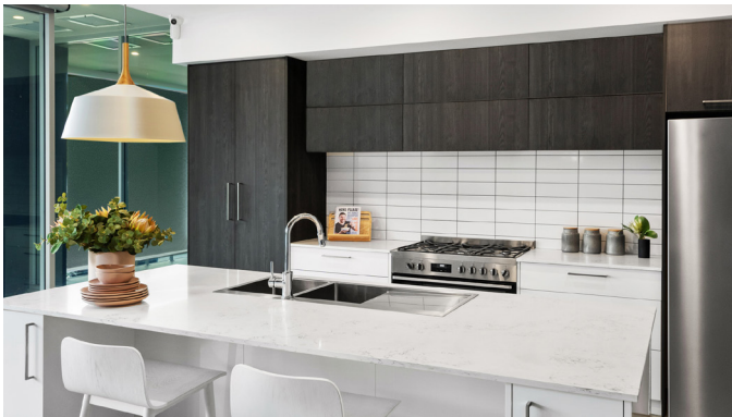
STONE BENCH TOPS, BREAKFAST BAR, OVERHEAD CUPBOARDS AND MUCH MORE

Our Designer Specification has features that makes your home complete from the moment you walk in. Ducted heating, LED downlights, High ceilings, Butler's Pantry, Designer Laundry, large floortiles, European style tapware, showerheads and basins, carpets, amazing Designer Kitchen and more. Our Designer Kitchens feature an entertainer's stone island bench with breakfast bar, 900mm wide stainless steel freestanding stove, integrated rangehood and endless storage making cooking in your kitchen an absolute dream! Make your kitchen your own with your choice of cabinetry colours, splashbacks, and stone benchtops.