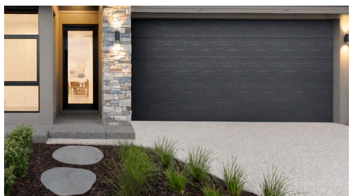
MOTORISED GARAGE DOOR WITH REMOTE CONTROLS