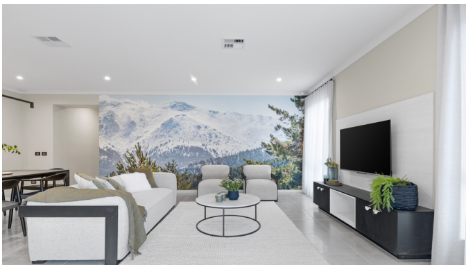
2590MM HIGH CEILINGS