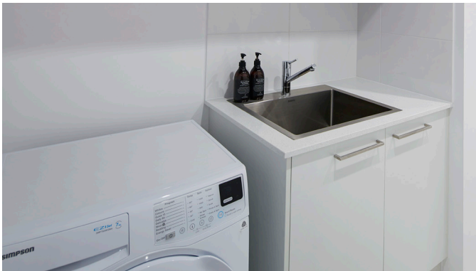
STONE BENCHTOP AND 1M INSET TROUGH IN CABINET TO LAUNDRY