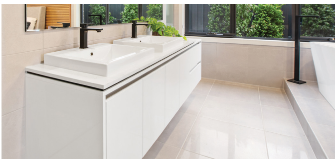
LARGER WET AREA TILES