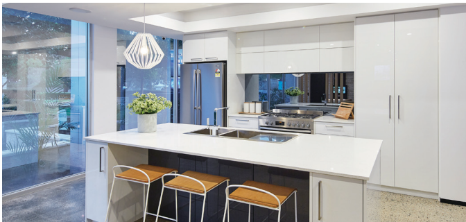
STONE BENCH TOPS, BREAKFAST BAR, OVERHEAD CUPBOARDS AND MUCH MORE

Our Classic Special Specification has features that makes your home complete from the moment you walk in. Ducted heating, high ceilings, butler's pantry, large floortiles, european style tapware, showerheads and basins, carpets, amazing Designer Kitchen and more. Our Designer Kitchens feature an entertainer's stone island bench with breakfast bar, 900mm wide stainless steel freestanding stove, integrated rangehood and endless storage making cooking in your kitchen an absolute dream! Make your kitchen your own with your choice of cabinetry colours, splashbacks, and stone benchtops.