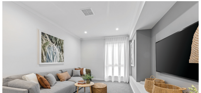
DUCTED HEATING AND INTERNAL 3 COAT WALL PAINTING