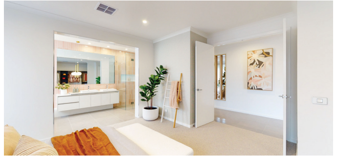
DOUBLE DOORS TO MASTER BEDROOM