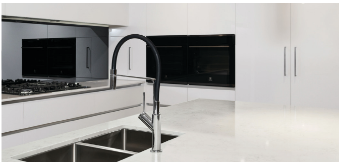
EUROPEAN STYLE FLICKMIXER TAPWARE THROUGHOUT