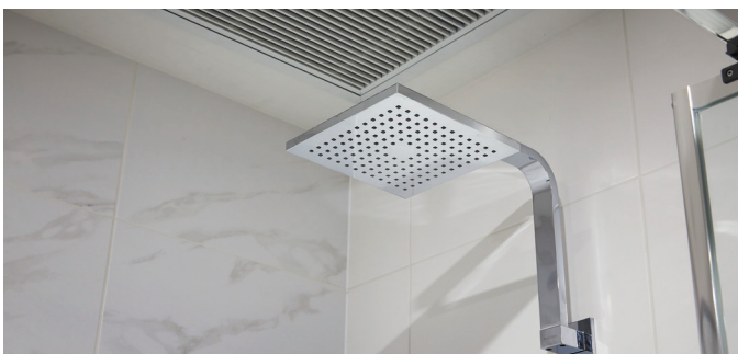
BATHROOM: EUROPEAN STYLE RAINHEAD