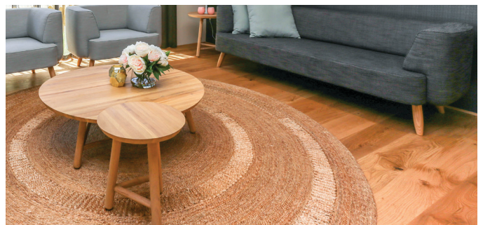
LAMINATE FLOORING TO MAIN LIVING AREAS