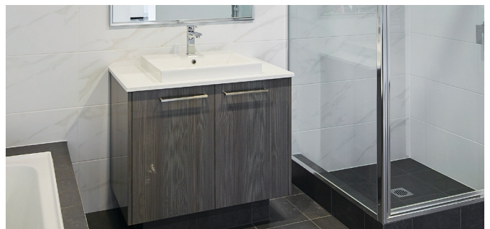
BATHROOM: SINGLE DESIGNER VANITY WITH STONE BENCHTOP AND HIGH GLOSS CABINETS