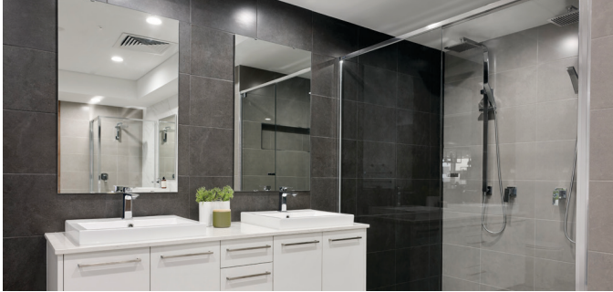
ENSUITE: DOUBLE SHOWER AND SEMI FRAMELESS SCREEN