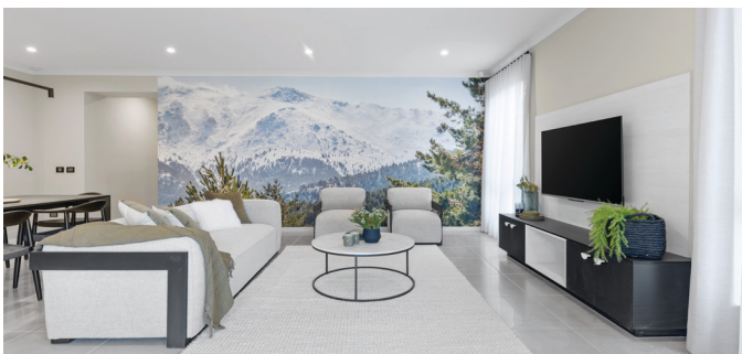
2590MM HIGH CEILINGS