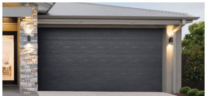
DOUBLE LOCK UP GARAGE WITH MOTORISED REMOTE CONTROL DOOR