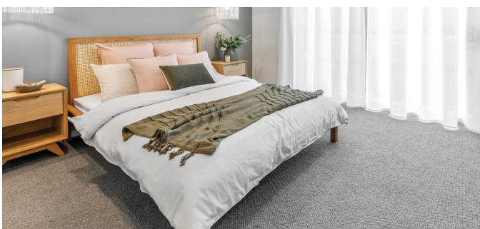
LOOP PILE CARPETS