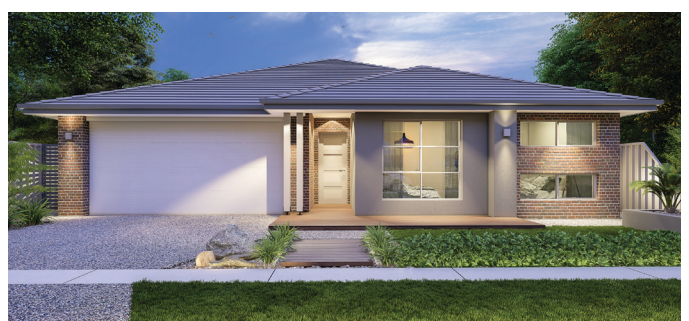
CATEGORY 1 FACADE