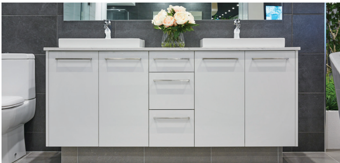
ENSUITE: DOUBLE DESIGNER VANITY WITH STONE BENCHTOPS AND HIGH GLOSS CABINETS