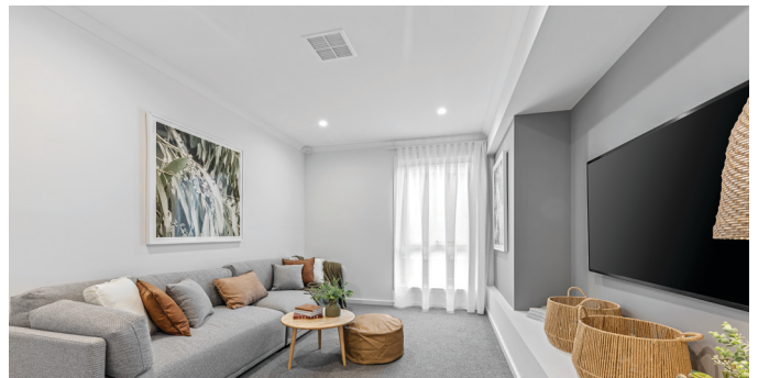
DUCTED HEATING, INTERNAL 3 COAT WALL PAINTING, DOUBLE LOCK UP GARAGE