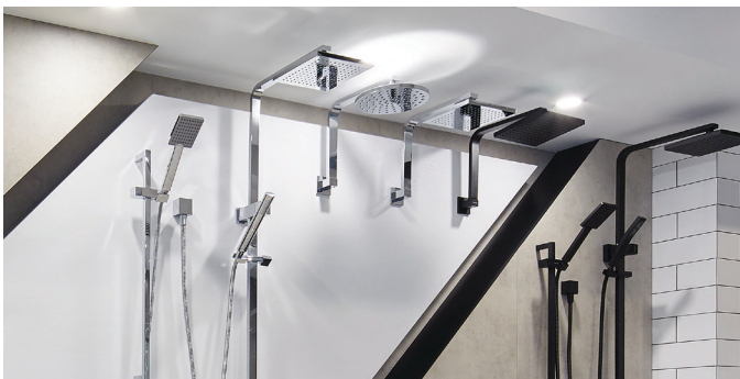
EUROPEAN STYLE SHOWER HEADS