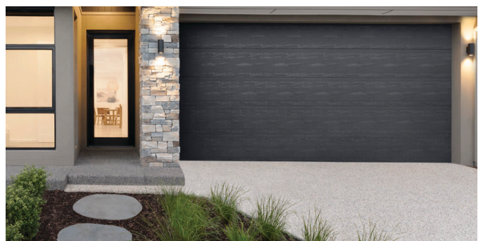
MOTORISED GARAGE DOOR WITH REMOTE CONTROLS