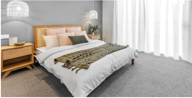
LOOP PILE CARPETS