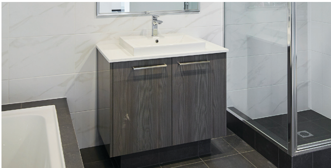
BATHROOM - SINGLE DESIGNER VANITY WITH STONE BENCHTOP AND HIGH GLOSS CABINETS