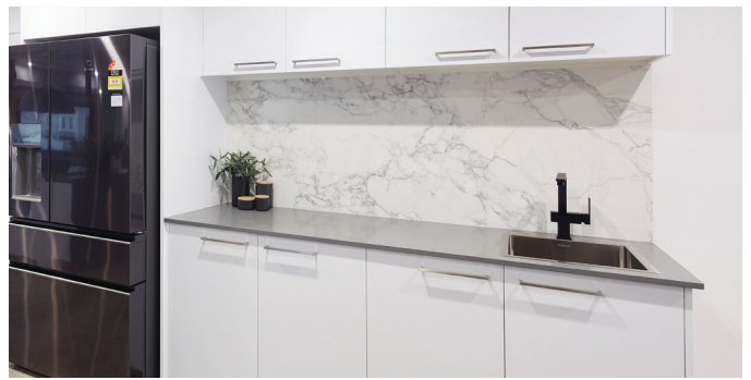
LUXURY BUTLER'S PANTRY