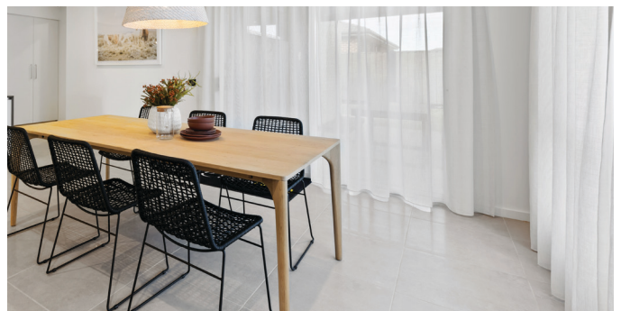
450MM X 450MM MAIN FLOOR TILES