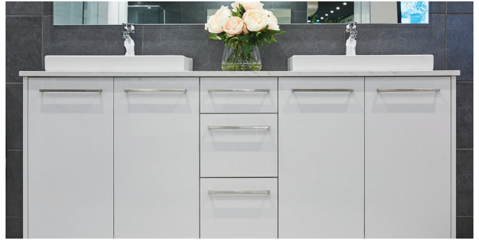
ENSUITE - DOUBLE DESIGNER VANITY WITH STONE BENCHTOP AND HIGH GLOSS CABINETS