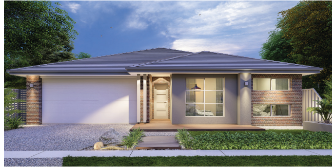
CATEGORY 1 ELEVATION