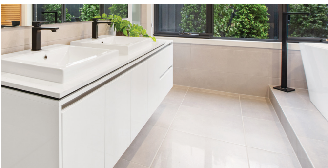
LARGER WET AREA TILES