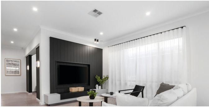
LED DOWNLIGHTS THROUGHOUT