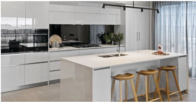
STONE BENCHTOPS, BREAKFAST BAR, OVERHEAD CUPBOARDS AND MUCH MORE

Our Luxury Specification has features that makes your home complete from the moment you walk in. Ducted Heating, LED downlights, High ceilings, Luxury Butlers Pantry and Laundry, large floor tiles, European style tapware, showerheads and basins, carpets, amazing Luxury Kitchen and more. Our Luxury Kitchens feature an entertainer's stone island benchtops with waterfall ends, double wall ovens, five burner glass gas cooktop, integrated rangehood and endless storage making cooking in your kitchen an absolute dream! Make your kitchen your own with your choice of cabinetry colours, splashbacks, and stone benchtops.