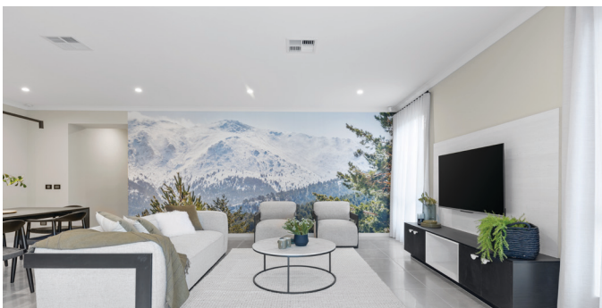
2590mm HIGH CEILINGS