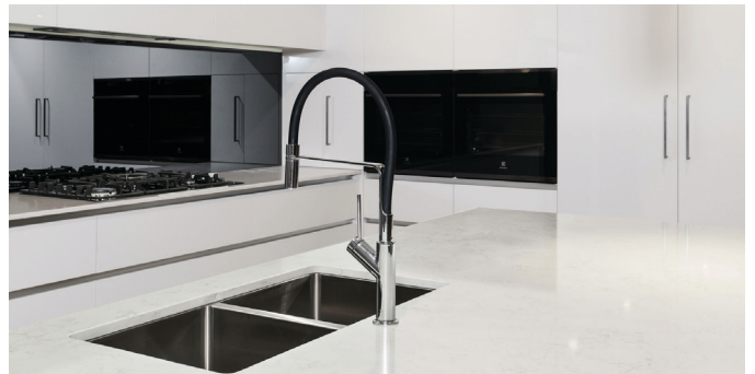
EUROPEAN STYLE FLICKMIXER TAPWARE THROUGHOUT